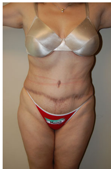
Fig. 1 Preoperative view of a 43-year-old woman in 2008, 2 years after abdominoplasty performed outside the United States

In July 2008, the second surgical intervention was performed by the senior author of this study, and the tissue expander was removed. The umbilicus was reopened and found to have intact dermis and epidermis within the stalk. In the next step, 420 g of lower abdominal tissue below the old scar was excised, the abdominal skin flap was lowered, and a new site for the umbilicus within the abdominal skin flap was created. A partial capsulectomy was performed under the abdominal skin flap to allow for enhanced skin