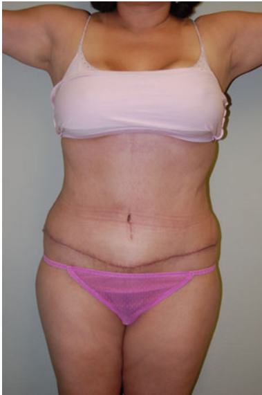
Fig. 3 Postoperative views 1 month after abdominoplasty