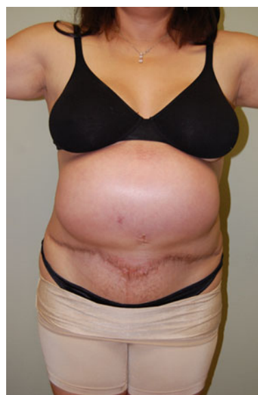
Fig. 2 Patient with a central upper abdominal tissue expander filled to 3.5 L

flap mobility and to prevent a postoperative seroma. A drain was exited through the right side of the incision.